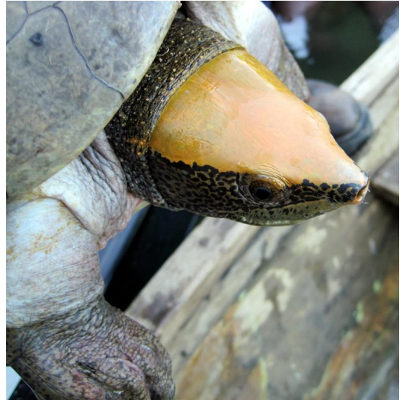
The male hicatee is recognized by its bright yellow head and a longer, thicker tail.